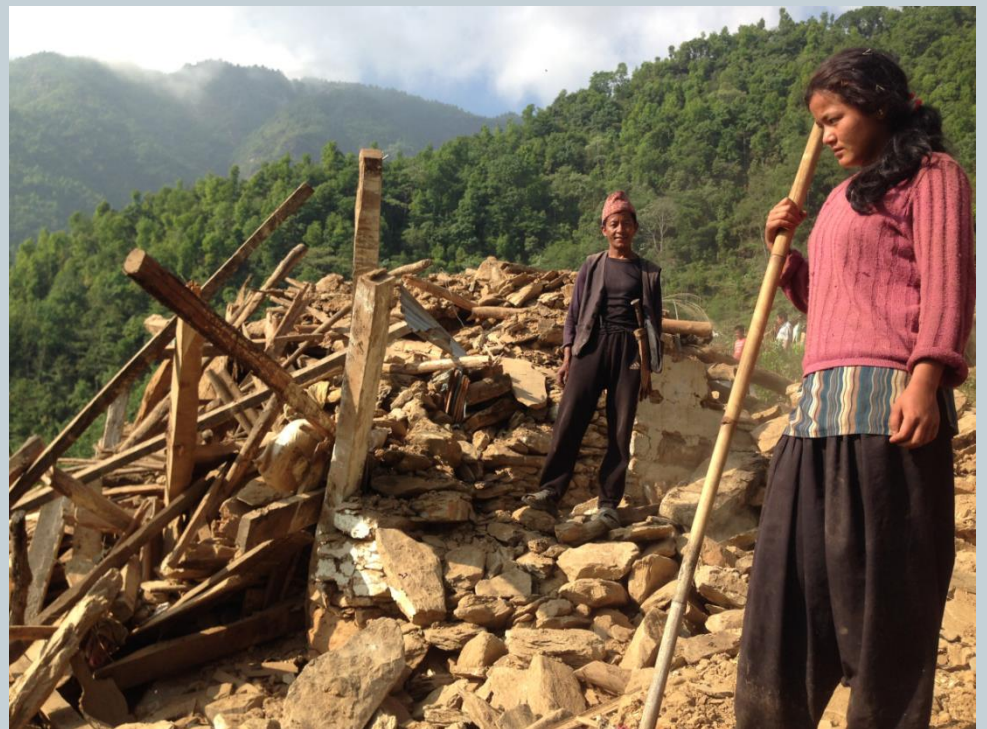
Suspa-Kshemawati VDC, Dolakha district, Nepal, May 2015.