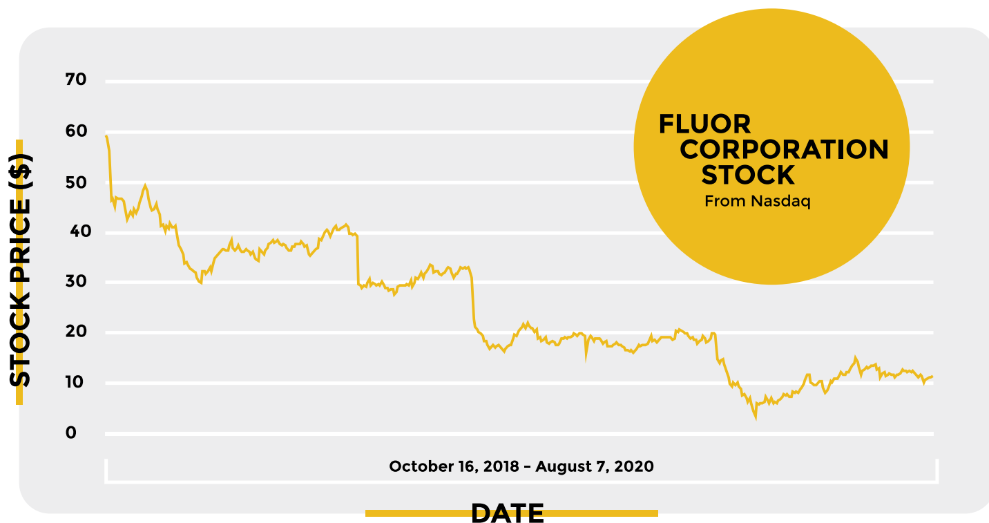
Figure 2: Prices of Fluor Corporation Common Stock from Nasdaq.com

NuScale’s majority shareholder is the Fluor Corporation, which is reported to have spent $27 million in 2011 to acquire the company. 52 In recent years, Fluor Corporation has seen its financial foundations in trouble. Fluor Corporation’s stock prices have declined from roughly $60 a share in October 2018 to as low as $3.40 in March 2020. 53 It subsequently recovered somewhat and was a little over $11 as of early August but the outlook is still bleak, in part because it is being investigated by the Securities and Exchange Commission. 54 The company also disclosed that the Justice Department has subpoenaed documents concerning a fixed-price federal project. 55 Depending on the risk allocation ultimately reflected in the relevant agreements, the proposed UAMPS project may resemble a fixed price contract of the sort that Fluor has said that it will no longer undertake.