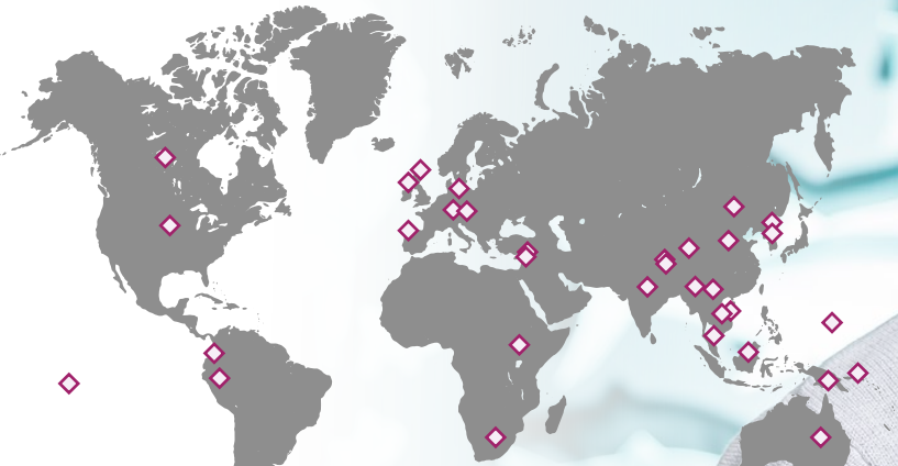
◆ Countries and regions where faculty research is taking place

"[We] must move faster. Overfishing increases global emergencies such as climate change, biodiversity loss and food insecurity – particularly for already vulnerable communities, such as Indigenous Peoples and populations in the Global South."